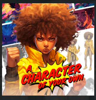
A CHARACTER OF YOUR OWN