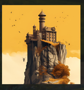
THE LICH OF LYMONIX