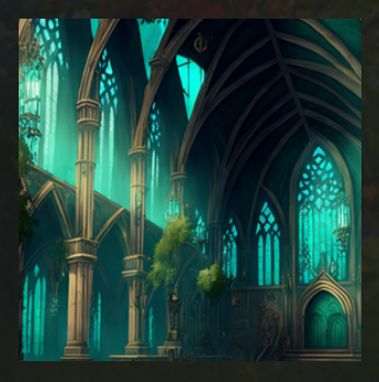
THE CRYSTAL TOWER