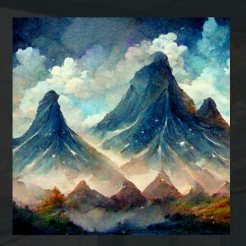
PEAKS OF MYSTERY