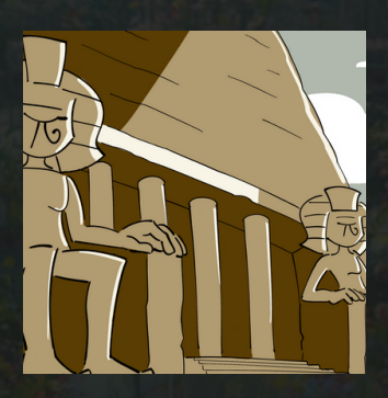
THE EYE OF THE PYRAMID