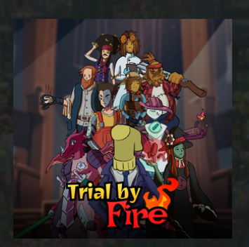
TRIAL BY FIRE