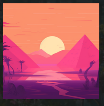
PRINCE OF HAR